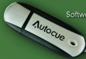
Software USB stick

Click and drag the QStart icon into the applications folder to install.